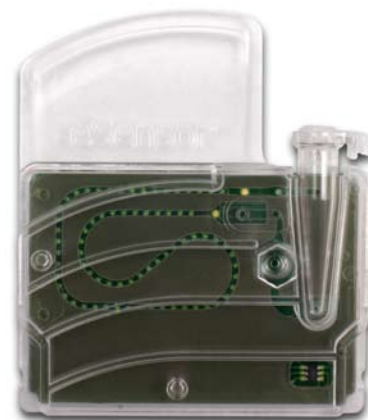
The eSensor® CF Carrier Detection (CFCD) System reports cystic fibrosis carrier results.

"Essentially, what we're doing is making genetic testing available in physicians' offices and clinics," says Aviva Jacobs, PhD, who oversees Osmetech's product development. "A person can now go to their doctor to be tested, the doctor will send out the patient's sample to a local lab and the lab can then very quickly and affordably run the tests.