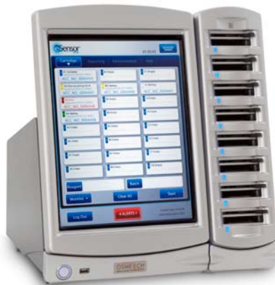
The Osmetech eSensor® XT-8 System is a complete bench-top instrument for detecting nucleic acids on a microarray.

Similar diagnostic tools existed prior to the introduction of the eSensor system, but, says Jacobs, “Ours is unique in that our instrument is a lot less expensive. A lot of tests rely on fluorescence, but ours is based on electrochemical detection.”