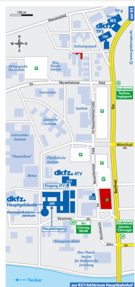
Dark-blue: DKFZ buildings, red: recommended parking area

From Heidelberg main station, take tram lines 21 (direction "OEG-Bahnhof") or 24 (direction "Burgstr."). Get off at stop "Technologiepark". Cross the two-lane street ("Berliner Str.") and walk into the street "Im Neuenheimer Feld". Turn right at the traffic lights and walk into the small street leading straight into Technology Park. Walking time 5 - 10 minutes.