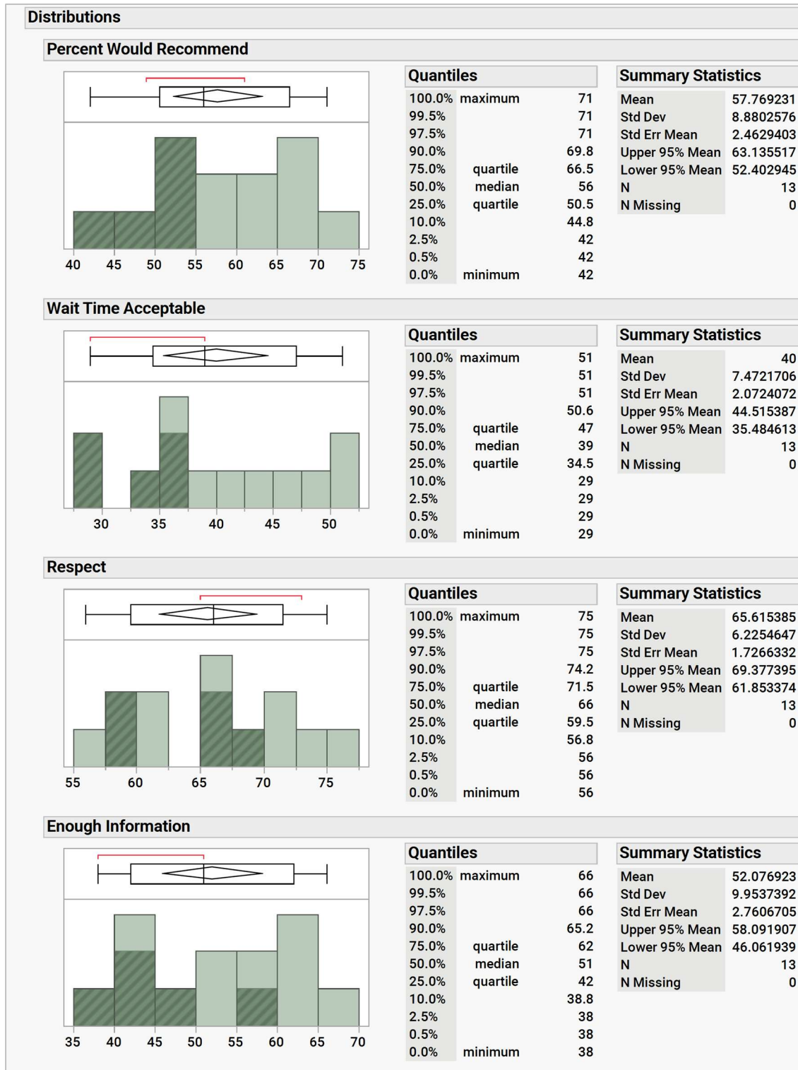
Exhibit 7 Distributions with Dynamic Linking

(Analyze > Distribution; Drag all 4 variables to Y, Columns, and click OK. Click on red triangle next to Distributions and select Stack. Hold shift key and click on each of the lowest bars for Percent Would Recommend.)