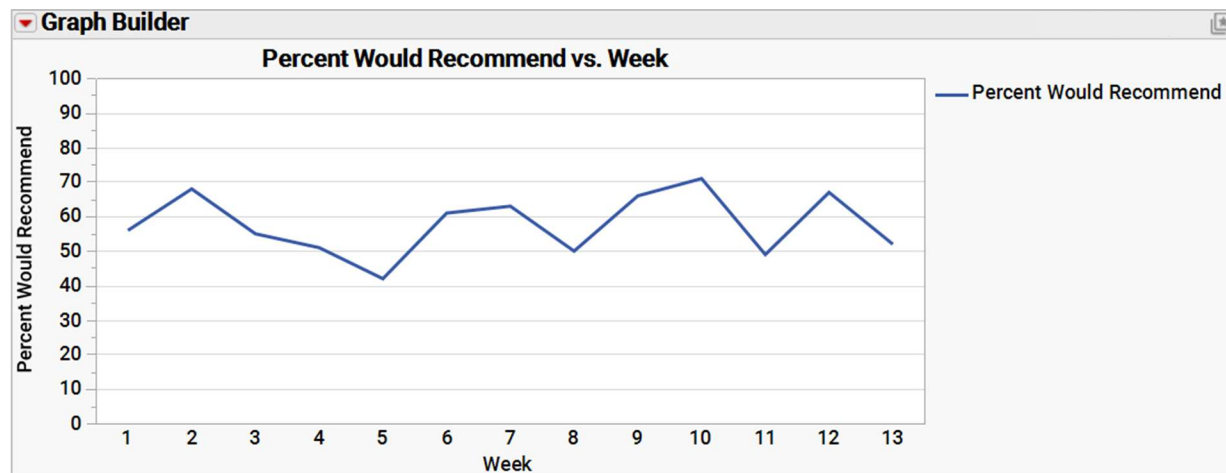
Exhibit 5 Run Chart – Percent Would Recommend

(Graph > Graph Builder; Drag Percent Would Recommend to the Y zone and Drag Week to the X zone. Select the Line icon at the top of the graph. Right-click on the y-axis, choose Axis Settings from menu, and check the box for Major Gridlines. Note that to apply a 0 to 100% scale, Make Minimum = 0, Maximum = 100, Increment = 10, Tick Marks = 1. Click OK to accept axis setting changes, and click Done to close the Graph Builder control panel.)