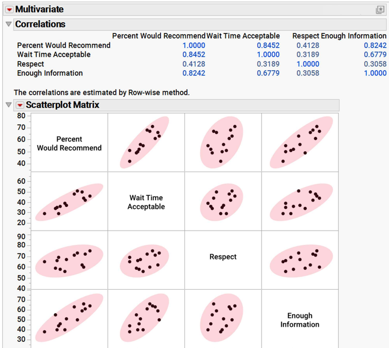
Exhibit 9 Correlations

(Analyze > Multivariate Methods > Multivariate; Select all variables of interest as Y, Columns and click OK. Choose Shaded Ellipses under lower red triangle)